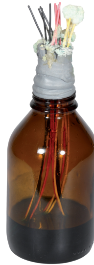
Test setup: Verification of capillary effect with AdBlue in a glass bottle • Yellow: Standard cables • Black/red: Anti-capillary cables